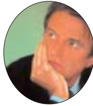
Bernard Kouchner Minister for Health, France