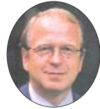
Erkki Liikanen, Commissioner for Enterprise and Information Society