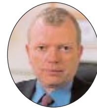
Philip Hunt, Parliamentary Under Secretary of State for Health, United Kingdom