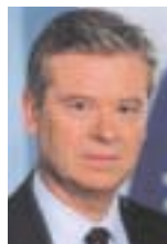
Erkki Liikanen, Member of the European Commission responsible for Enterprise and Information Society

A handwritten signature in black ink, appearing to read 'David Byrne'.