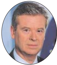
David Byrne, Commissioner for Health and Consumer Protection