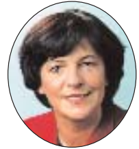
Ulla Schmidt Federal Minister for Health, Germany